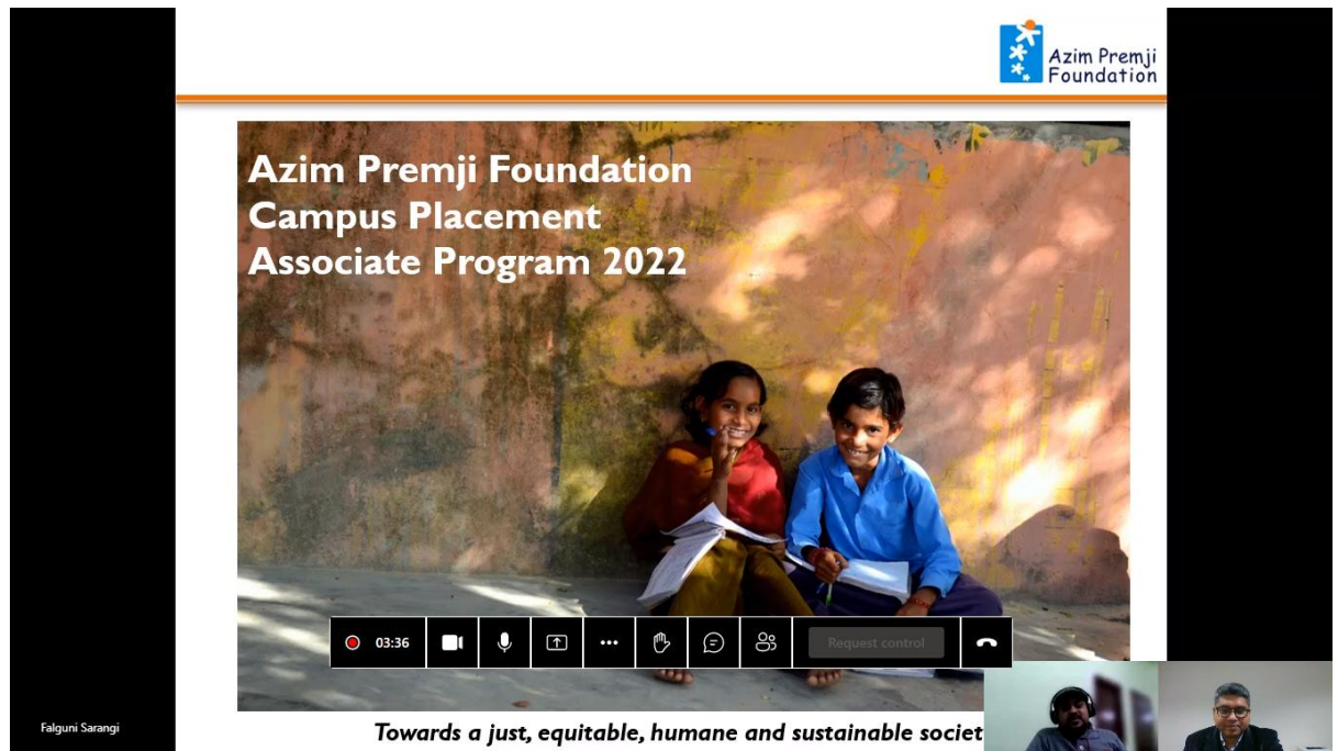
Azim Premji Foundation Virtual Pre-Placement Talk